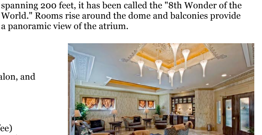
Spa at the West Baden Springs Hotel