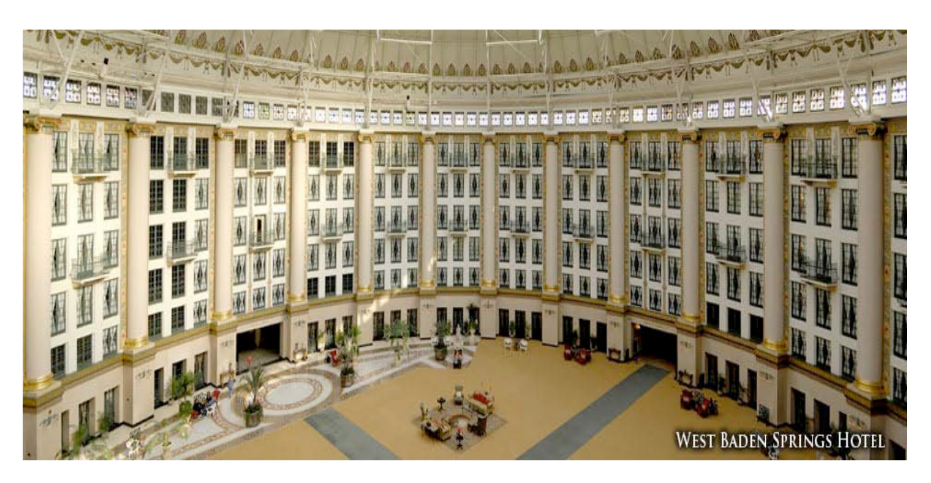
Atrium of the West Baden Springs Hotel – site of the PRMS Welcome Reception

Psychiatrists, Primary Care Physicians, Physicians of Other Specialties, Mental Health Providers, Nurse Practitioners, Physician Assistants, and Hospitalists